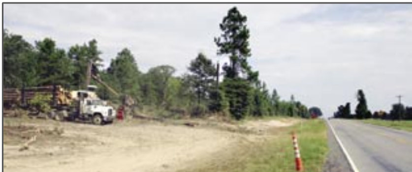
Construction is underway on Hwy. 155 south of town. Workers are busy tearing down trees to make way for the new four lane divided highway. Completion of the expansion is scheduled for the fall of 2011.